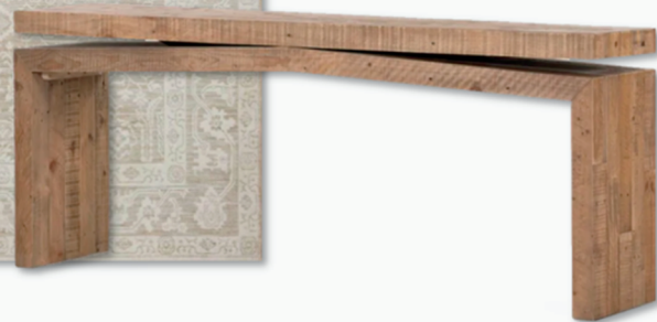
RECLAIMED WOOD CONSOLE