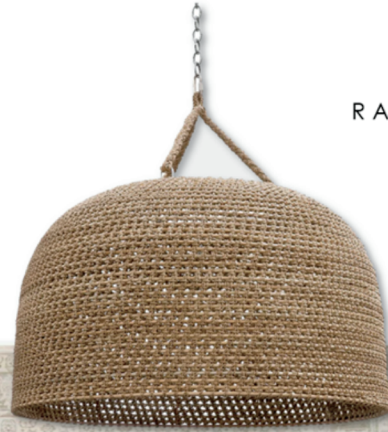
RATTAN LIGHT FIXTURE