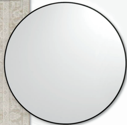
OVER SIZED ROUND MIRROR