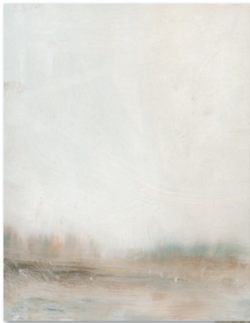
LARGE NEUTRAL ABSTRACT ART